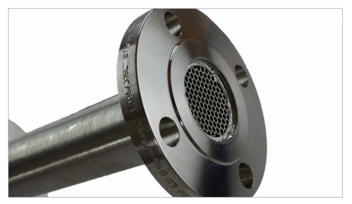
Built-in flow conditioning improves measurement accuracy in spaceconstrained applications.

This feature is of particular value in environmental monitoring applications, such as flares and vents, where periodic calibration validation is mandated. These tests help operators comply with environmental mandates and eliminates the cost and inconvenience of annual factory calibration. It can also be used to streamline quality assurance, improve process initiatives, and apply scheduled maintenance procedures.